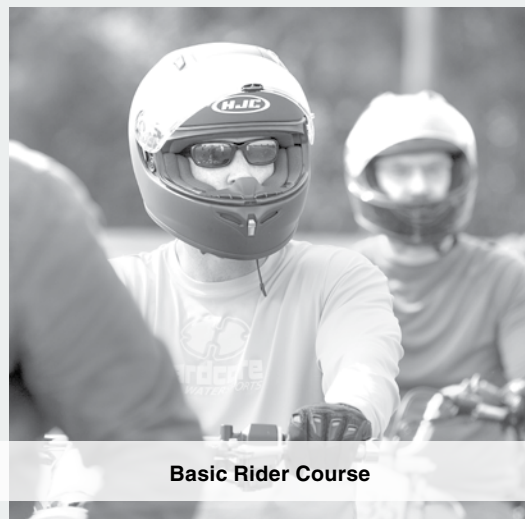
Basic Rider Course